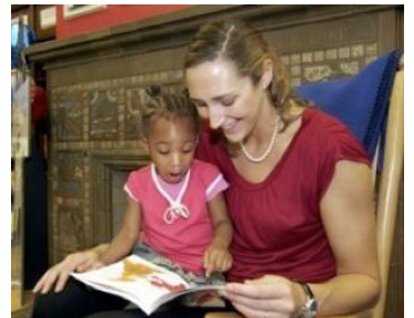
Ruth Riley reads with student

Take, for example, Project READS Breakfast of Champions last spring. While the event was designed as a fundraiser for the agency, the guest speaker, Ruth Riley, represented another avenue of support for children's literacy. As co-founder of Inspire Transformation, Ms. Riley promotes the development of both health and literacy in youth. Buoyed by Ms. Riley's presence, the Champions Breakfast produced both funds for Project READS [see list of Breakfast Donors, bottom page 2] and heightened an awareness in our community of the need for engagement in a complete education.